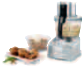
Food Processors Robots de cuisine