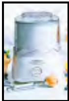
ICE CREAM MAKERS

Cuisinart offers an extensive assortment of top quality products to make life in the kitchen easier than ever. Try some of our other countertop appliances and cookware, and Savor the Good Life™.